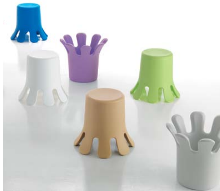
Sgabello-vaso | Stool-vase | Schemel-Vase Tabouret-vase | Taburete-jarrón