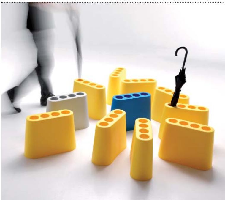
Portaombrello | Umbrella stand | Schirmständer Porte-parapluies | Portaparaguas